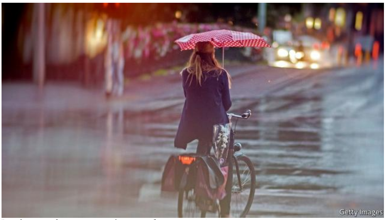
But they can also stop women's careers from progressing

Getting hold of a Dutch woman on a Wednesday can be tricky. For most primary schools it is a half-day, and as three-quarters of working women are part-time, it is a popular day to take off. The Dutch are world champions at part-time work and are often lauded for their healthy work-life balance and happy children. But these come at a price. Among western European countries, the Netherlands has the largest gap between men's and women's pension entitlements, and the largest in monthly income. Even though a similar share of Dutch women are in the labour force as elsewhere in western Europe, their contribution to gdp, at 33%, is far lower, largely because they work fewer hours.